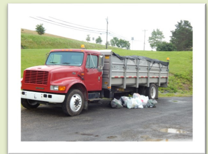
Co-op Recycle Truck