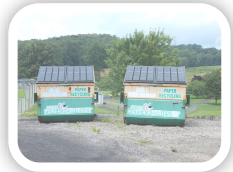
PAPER RECYCLE BINS

The yellow and green PAPER recycle bins are located behind the dumpster for disposal of paper only.