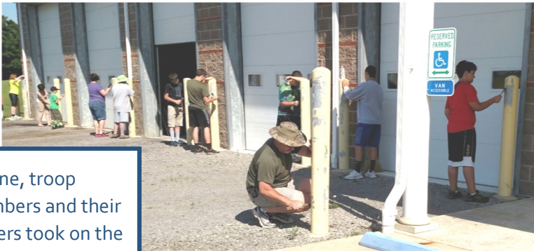
In June, troop members and their leaders took on the job of scraping and repainting the safety bollards and refreshing the handicapped parking markings at the Municipal Complex.

Boy Scout Troop 496 will be doing some community service projects for the Township again this year. Some of the potential projects to name a few are cleaning up the springhouse (located by the Covered Bridge) and planting trees & flowers around it, painting the back wall of the Township building so that movies and such can be seen on it and hanging squirrel boxes and bluebird houses. The Scouts also have some Eagle Scout projects in the planning phase. One project is setting markers to show where the Riverfront & the Hill Road property borders are located. With this project, trails will be made in part of the property that will have QR codes in places to explain different things about the property such as a map, rules/boundaries and historical views. Another project being discussed is giving the Covered Bridge on the Township property a facelift. The Supervisors are excited to help the Boy Scouts get the hours that they need to advance to the next rank in the Scouts.