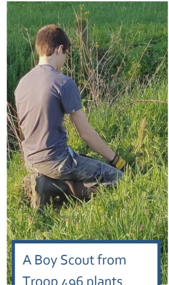
A Boy Scout from Troop 496 plants trees on Township property