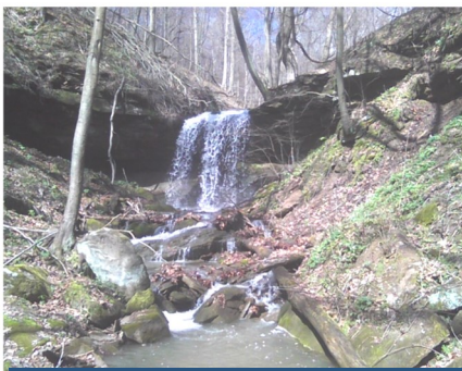
Waterfall on Greene Twp's Riverfront property off Hill Rd

DOLLAR GENERAL A cooperative effort between Greene Township and the Dollar General engineering firm has allowed the removal of dirt and shale behind the Greene Township Municipal Building. This dirt and shale was then used as fill at the Dollar General site on Route 168. The banks behind the Township building went from steep, rocky and unattractive to a graded, mowable portion of property that can potentially be landscaped. There is also talk of community movie night using that area behind the office building!