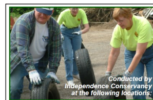
Conducted by Independence Conservancy at the following locations: